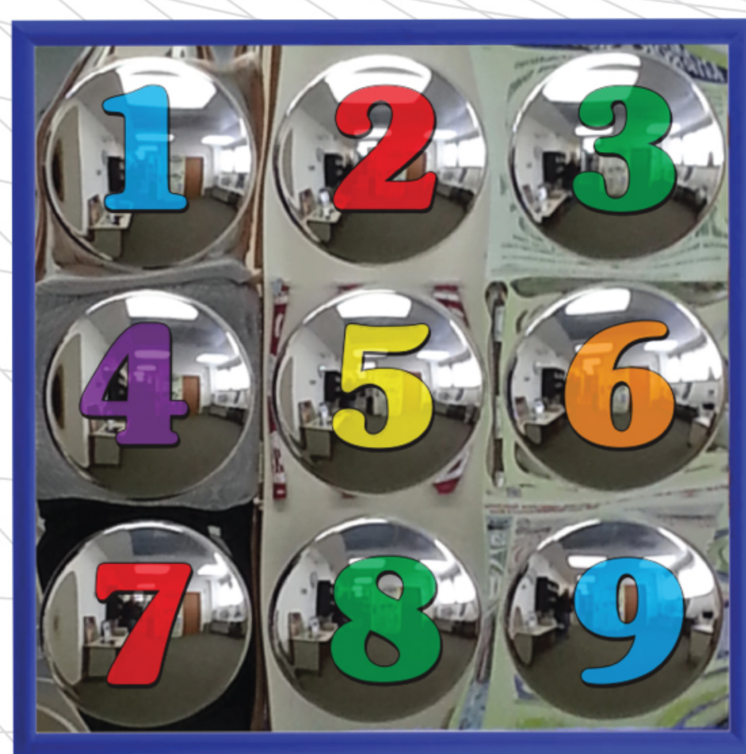
■ Bubble Mirrors 18 x 18 & 31 x 31