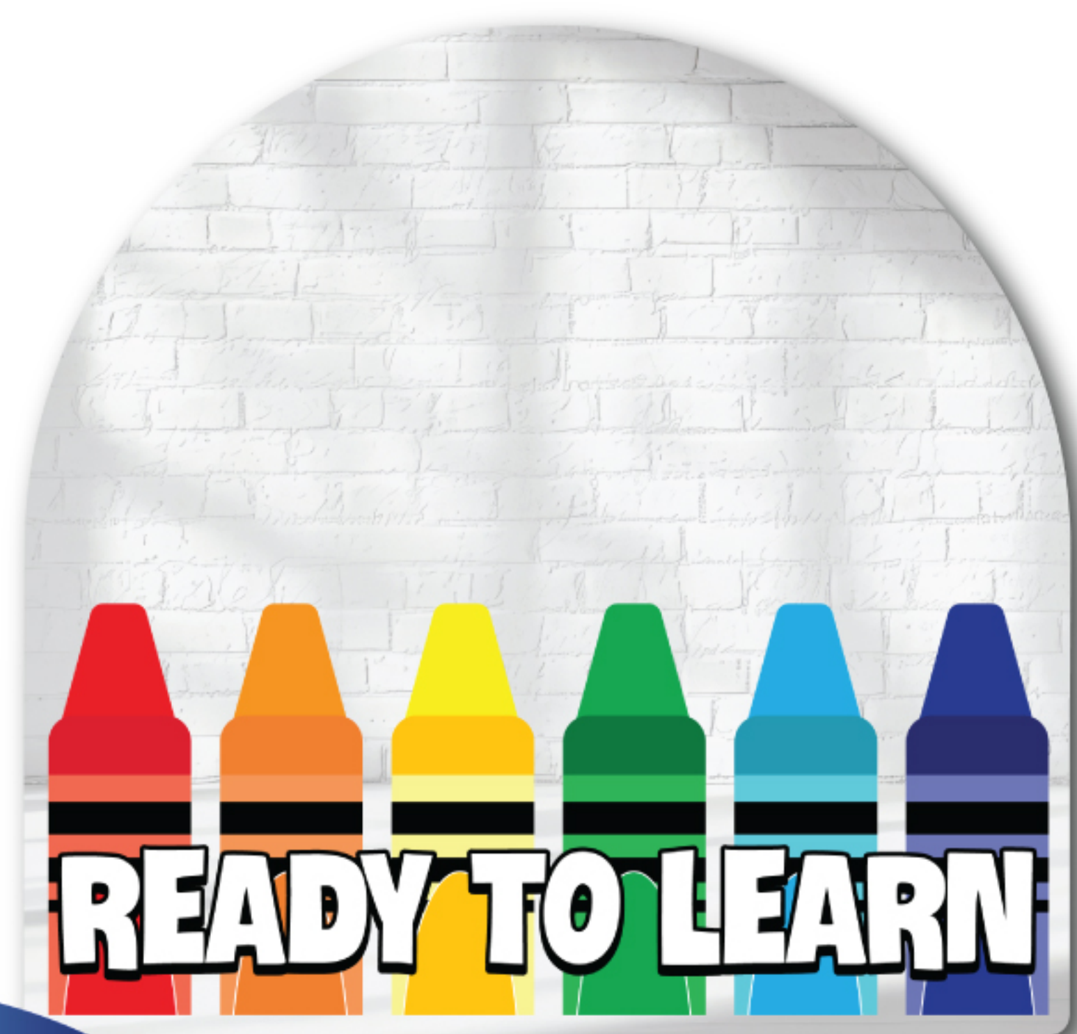
■ Mirrors 16 x 16 & 22 x 22