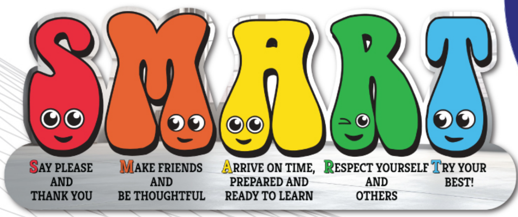
16 x 6.5 & 22 x 9