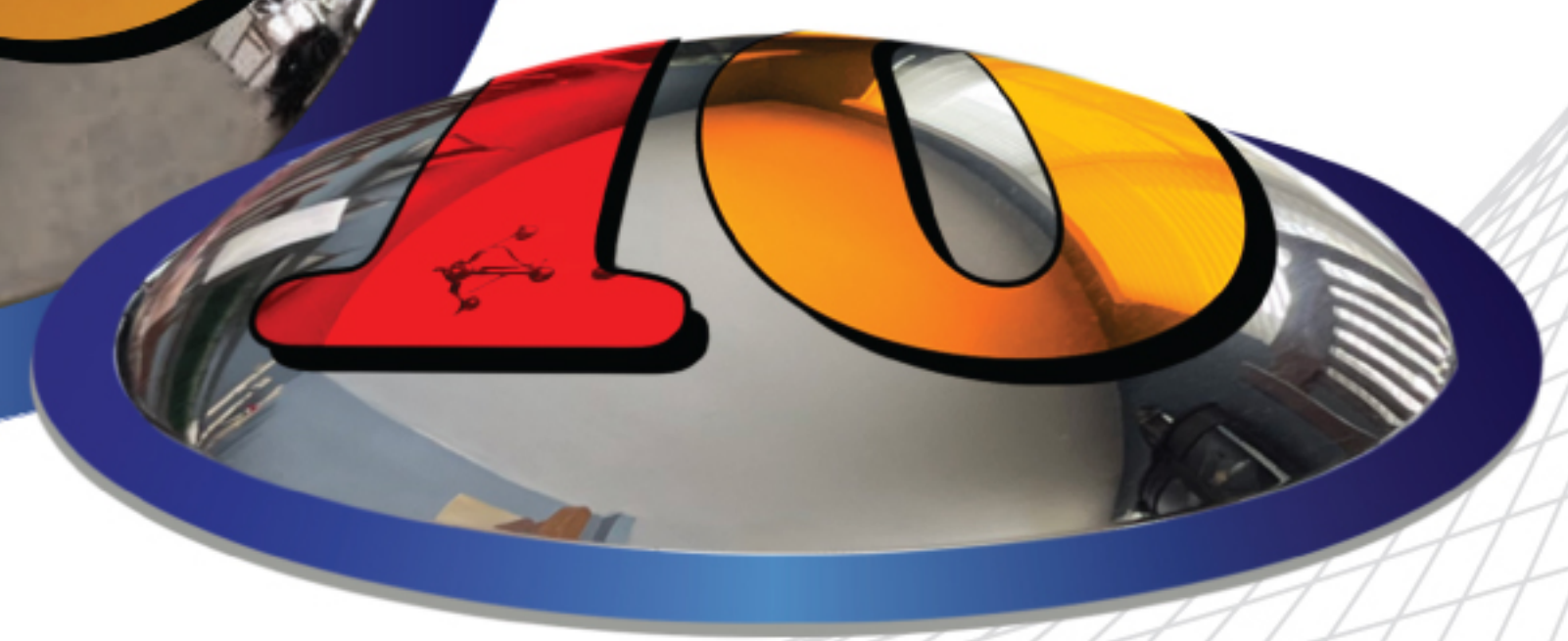
■ Convex Mirrors 18 dia. & 26 dia.